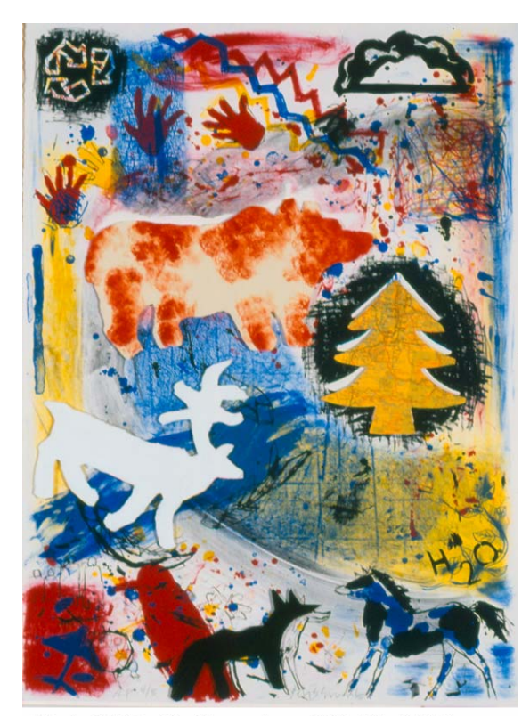
Ode to Chief Seattle, lithograph, ca. 1991, 30 x 22.25"

The earliest such work in the collection, Ode to Chief Seattle (1991), uses minimal references to language except for the chemical symbol for water and a few marks that can be read as letters. This lithograph with a collaged surface uses images of a cloud, red hands, a tree with the map of Washington printed on it, an elk, a coyote, a plane, and a horse over a blue shape that could be seen as transforming between a bird and a fish, all surrounding a hand painted red bear. In the upper corner are three arrows turning on one another, the visual symbol for recycling, and all of this is arranged over areas of red, yellow, blue and black, with a variety of abstract marks that causes the eye to move between the positive and negative spaces in the design in a way that is visually stimulating. This print, done in an edition of 30, was commissioned by the Washington State