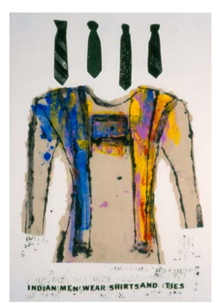
Indian Men Wear Shirts and Ties, lithograph, pulp paper painting, 1997, 41.75 x 29.25" Donated by Rutgers Center for Innovative Print and Paper

bear and Quick-to-See Smith relates, "...the work makes reference to traditional beliefs about the transformation between human and bear that are based on human qualities seen in standing bears." The petroglyph-like figure at the left side of the composition shows this transformation to human, but retains the bear's ears. The yellow glow which illuminates the center group of images focuses the eye so that it moves between the ghostly figure of the transformed bear with an exposed rib cage at the left and the image of the standing bear with the drawings that surround it. This creates an interesting visual tension that gives the work a sense of movement between realities.