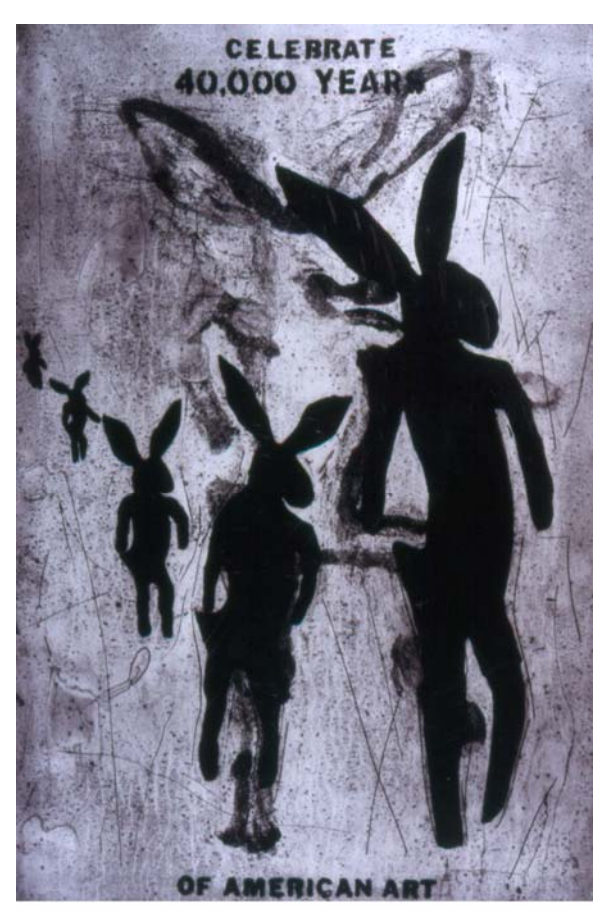
Celebrate 40,000 Years of American Art, collagraph, 1995, 71.5 x 47.5"