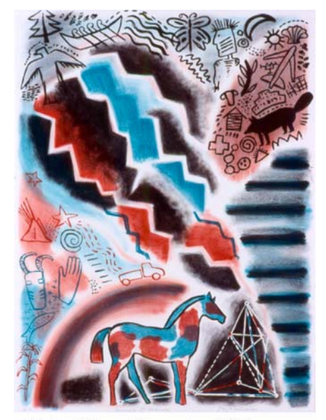
Winds of Change, lithograph, ca.1992, 30 x 22.5"

Arts Commission for a collection they put together to travel to public schools around the state. The work makes reference to local animals and environmental issues. The title pays homage to the Suquamish leader, Chief Seattle, after which the largest city in the state is named.