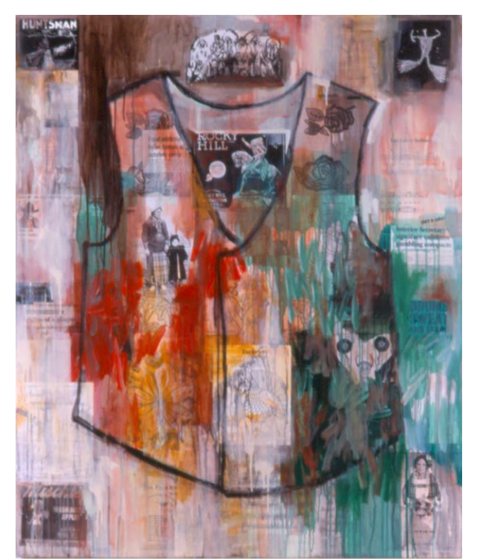
Flathead Vest: Father and Child, acrylic, paper, canvas, 1996, 60 x 50"

Quick-to-See Smith is one of the most creative and prolific of the American Indian artists whose work explores Native American aesthetic traditions in a modern and post-modern art context. Over the years she has worked in many media, using an impressive vocabulary of techniques including painting, printmaking, lush pastels, and richly layered mixed media works. Few artists working today are as sensitive to the effects of texts on images, or as skilled at creating and appropriating texts that capture the paradigms of American society in ways that reveal its implications. Quick-to-See Smith embeds her texts in a rich environment of images she creates and images she takes from a variety of sources. By doing this, she creates complex juxtapositions that recontextualize the way viewers understand not only relationships between Euro-American and indigenous American culture, but how she, as an artist of Flathead descent, views issues in both these cultures. Her works are thoughtful and thought provoking and can raise questions that explode stereotypes and myths about indigenous people. Two of the paintings in the collection of the Missoula Art Museum, Flathead Vest (1996) and Song and Dance (2003), demonstrate Quick-to-