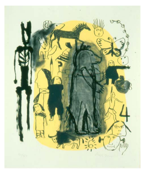
Sticky Mouth, lithograph, 1997, 21.5 x 19"

Wasatch Winter (2002), another of Quick-to-See Smith's image-based prints, uses petroglyph images of people, snakes, a bird, a rabbit, and horses with various marks. She employs overlapping triangular shapes that move from the upper left to lower right of the composition and function to remind the viewer of both mountains and tipis. This