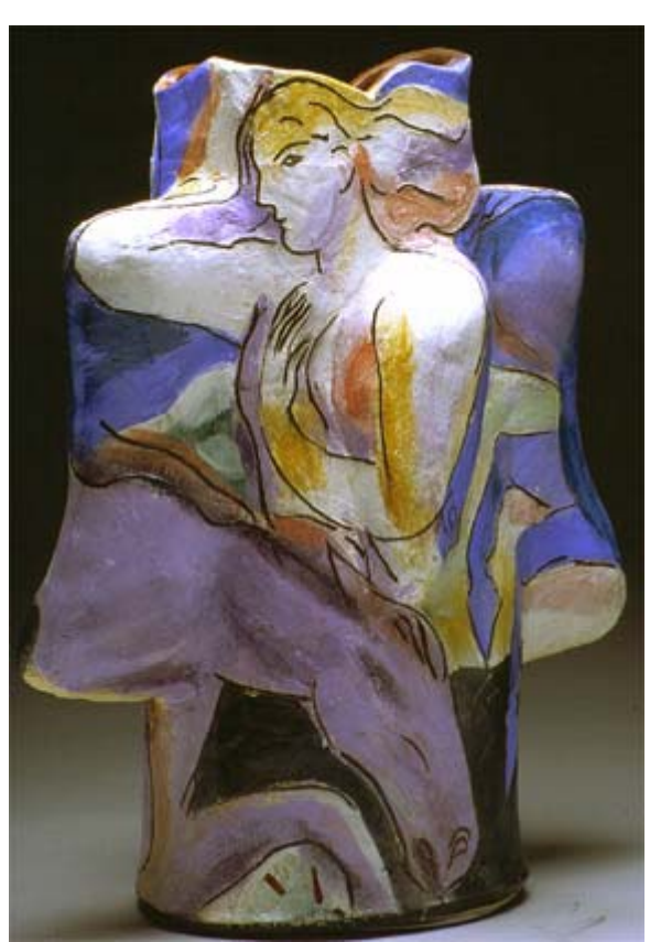
Avalon Stoneware 1994 <a href="http://www.rudyautio.com/Avalon.html">http://www.rudyautio.com/Avalon.html</a>