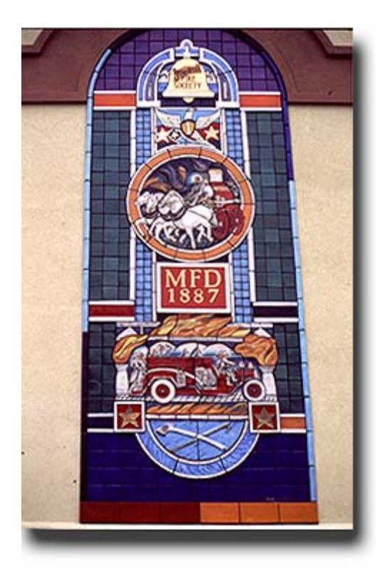
Missoula Fire Station Panel http://www.rudyautio.com/