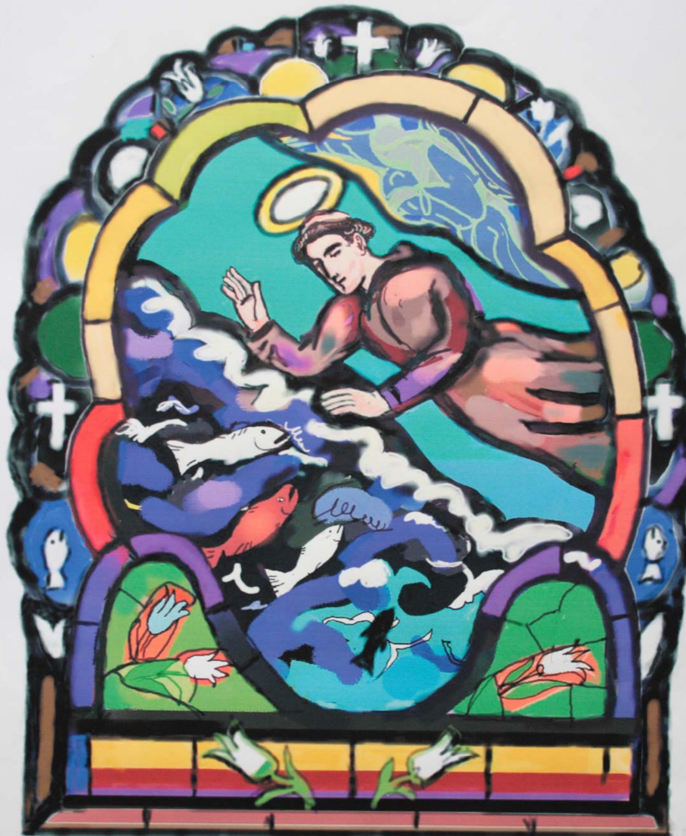
St Anthony & The Fishes (#3) with tiles on outside "Larger Rosette"